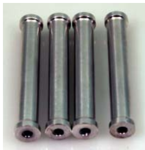
Engine Standoffs SPE-SPDOF -30