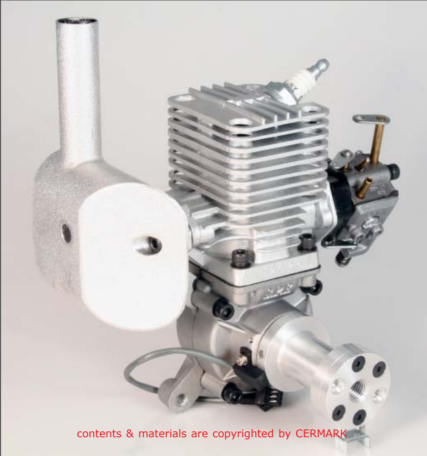
contents & materials are copyrighted by CERMARK